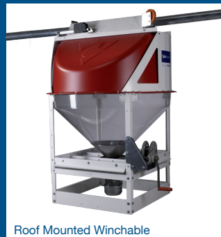
Roof Mounted Winchable